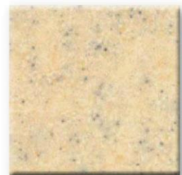
beach sand 103