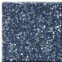
north sea 520