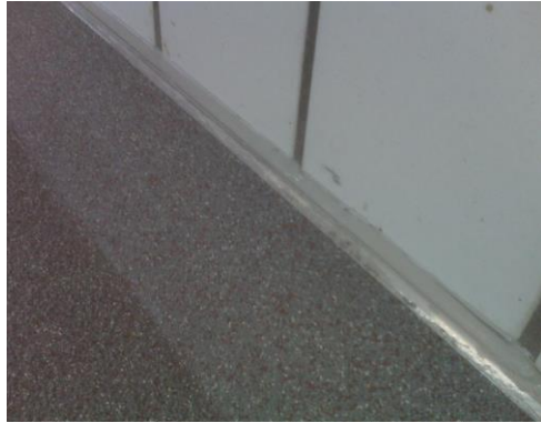
Completed cove with profile